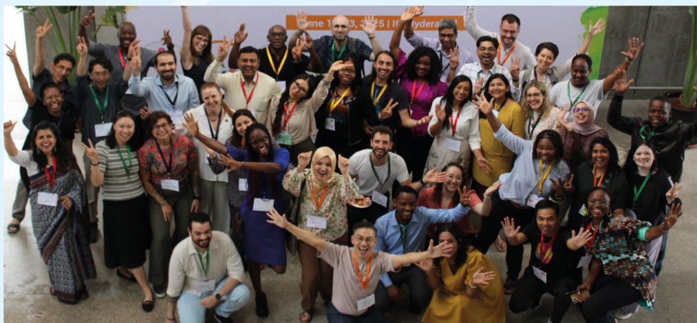
New GYA Members 2025 in Hyderabad, India

Applications are sought from early-career scholars who combine the highest level of research excellence with a demonstrated passion for delivering impact.