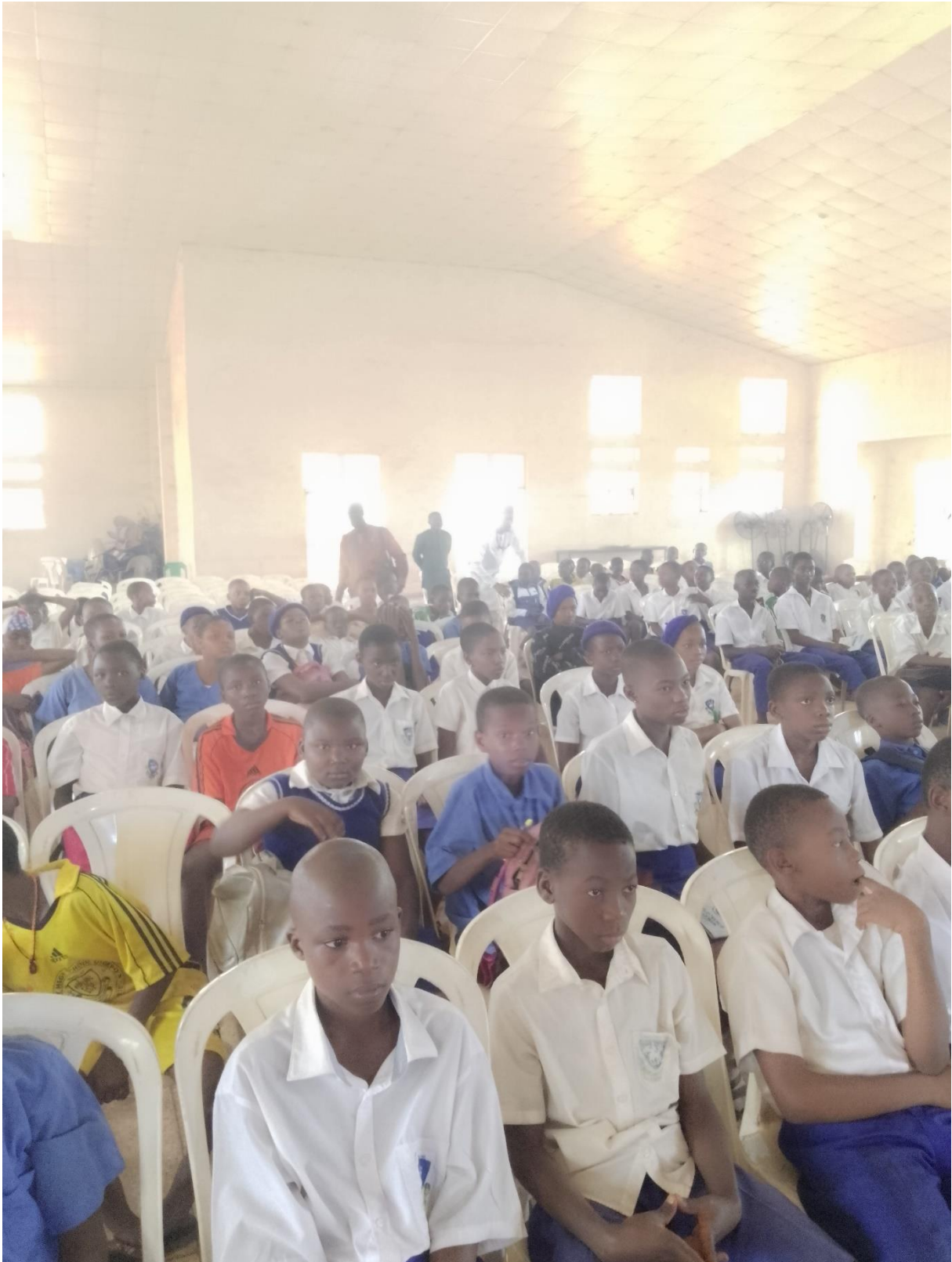
Plate 7: Cross-section of students at the public lecture