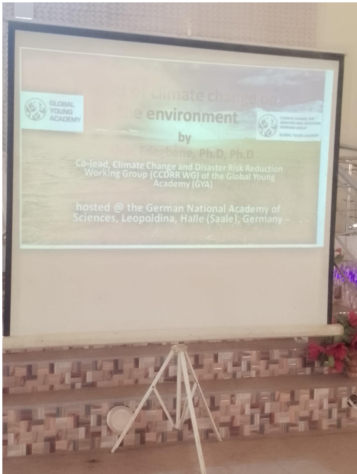
Plate 2: Projector set up ready for delivery of the lecture