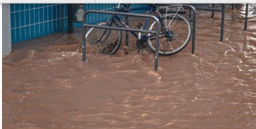
Image of a bicycle in floodwater

been deeply concerned about the recent flooding in western Europe.