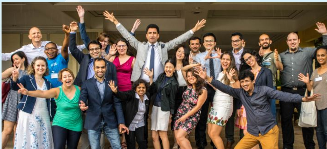
New GYA Members 2018 in Pattaya, Thailand

Applications are sought from early-career scholars who combine the highest level of research excellence with a demonstrated passion for delivering impact.