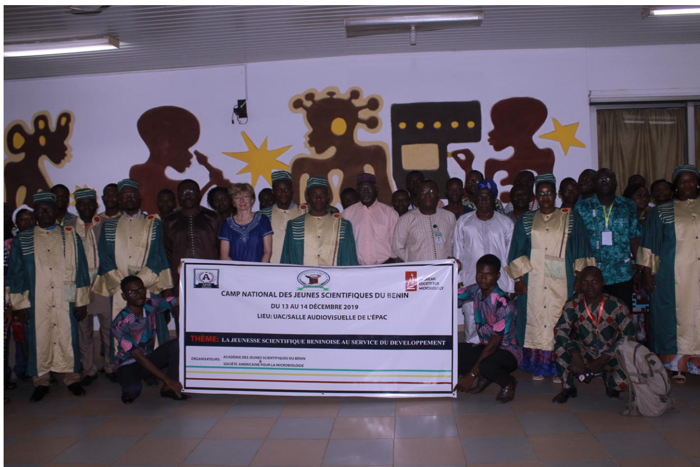
FAMILY PHOTO OF THE PARTICIPANTS OF THE FIRST NATIONAL CAMP FOR YOUNG SCIENTISTS OF BENIN