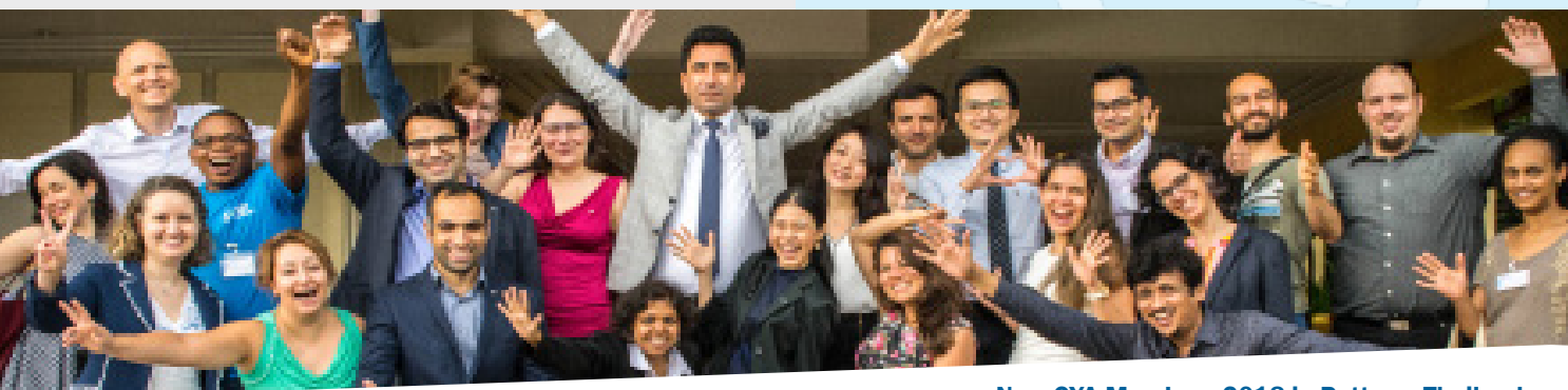
New GYA Members 2018 in Pattaya, Thailand

When the GYA was founded in 2010, only five young national science academies existed. The last 10 years have seen over 40 new national young academies and similar bodies established around the world, many with support from the GYA and our members. The GYA facilitates interaction between NYAs by co-organising regional and worldwide meetings.