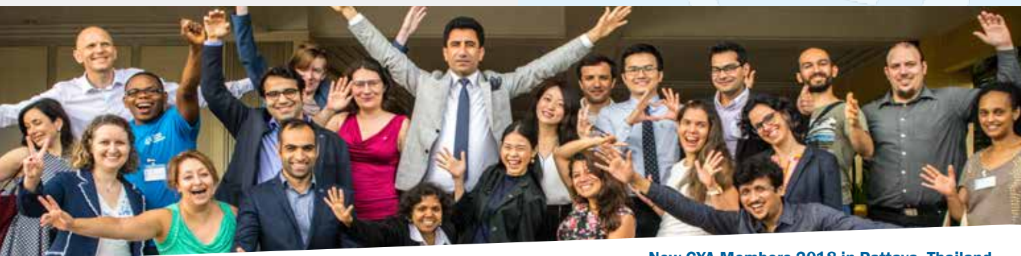
New GYA Members 2018 in Pattaya, Thailand

When the GYA was founded in 2010, only five young national science academies existed. The last 10 years have seen over 40 new national young academies and similar bodies established around the world, many with support from the GYA and our members. The GYA facilitates interaction between NYAs by co-organising regional and worldwide meetings.