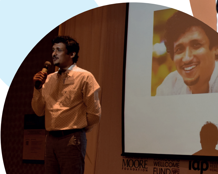
New GYA members being formally inducted into their 5-year membership.