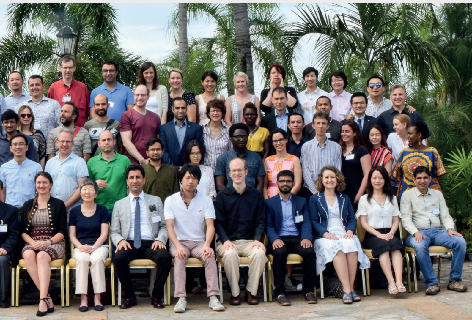
Participants of the GYA 8th International Conference for Young Scientists at the conference venue in Pattaya, Thailand.