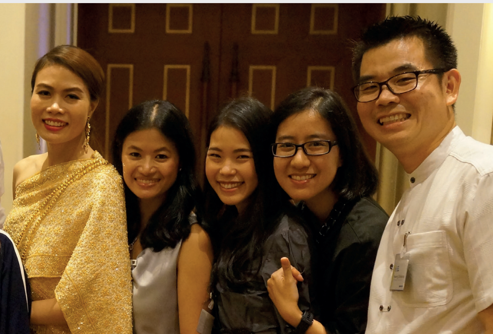
Members of the Local Organising Committee of the GYA 8th International Conference for Young Scientists at the conference venue in Pattaya, Thailand.