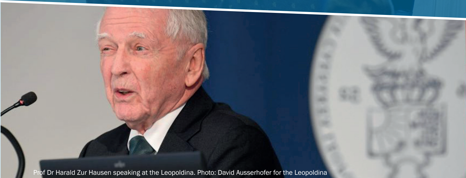
Prof Dr Harald Zur Hausen speaking at the Leopoldina.