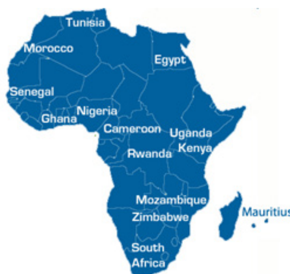
GloSYS Africa project focal countries

Readers can help by disseminating the GloSYS Africa Survey link through your own networks of African researchers.