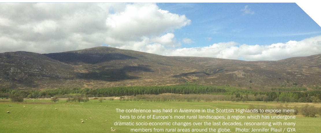
The conference was held in Aviemore in the Scottish Highlands to expose members to one of Europe's most rural landscapes; a region which has undergone dramatic socio-economic changes over the last decades, resonating with many members from rural areas around the globe.