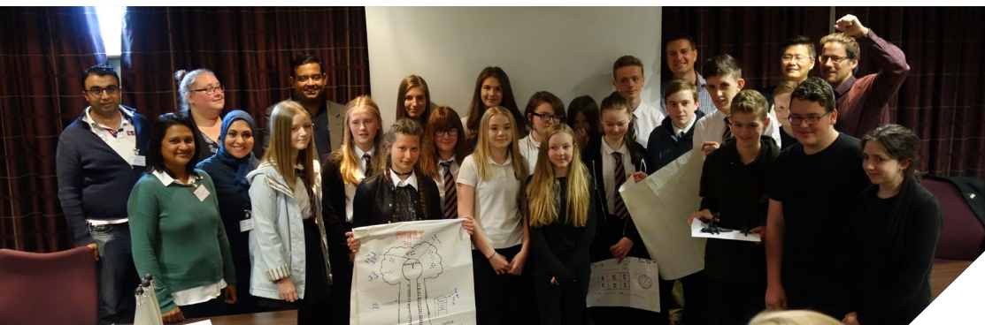
School students from remote parts of the Scottish Highlands participate in GYA member-led outreach activity "Synthetic Biology and the Future".

Macdonald Resort, Aviemore, 16 - 17 May 2017