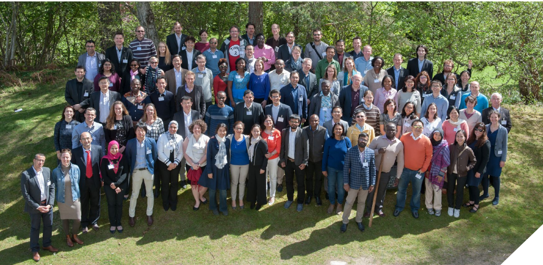
Participants of the GYA 7th International Conference for Young Scientists at the conference venue in Aviemore, Scotland.

This GYA 7th International Conference for Young Scientists and Annual General Meeting, held in Aviemore, UK, was timely in its focus on 'Social Justice in a Rapidly Changing World', considering the global changes we are witnessing, from election results to a changing environment. At the conference, we saw that young researchers, scholars and scientists are not only poised but also actively engaging to address the myriad of cross-sectoral challenges that come with current societal and environmental changes. In this context, social justice was em-