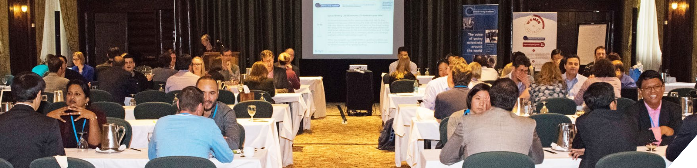
A speed-dating exercise fosters discussions and new ideas during the kick-off of the event.