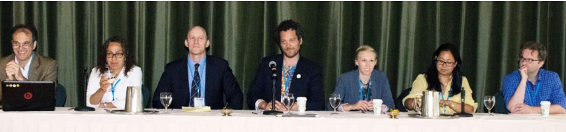
Accomplished members of the Canadian Maker movement discussing during the panel „The Changing Map of Innovation“.