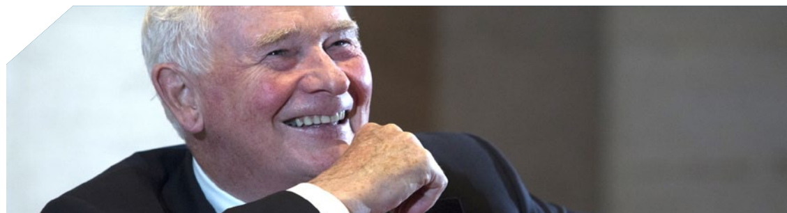
His Excellency David Johnston, Governor General of Canada, addresses the GYA members and distinguished conference participants.

An animated discussion followed the address, with His Excellency returning, in spirit and manner, to his previous professorial role after giving the floor to GYA members to ask questions. Two main themes emerged from this discourse. The first was on the crucial role that international experience serves in research and education for adding value to one's country at the national level. The second theme centred fittingly on the