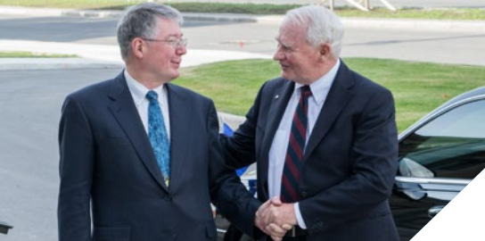
His Excellency David Johnston, Governor General of Canada, arriving in front of the NRC in Ottawa, Canada.