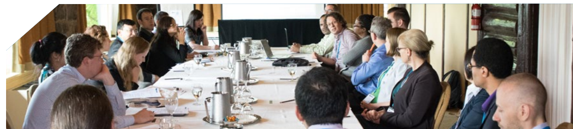
Meeting of members working in a particular activity theme during the Annual General Meeting.

All Themes have two leaders, one from the WGs and one from the EC, that will decide on the activities and projects of priority in the year ahead. During the