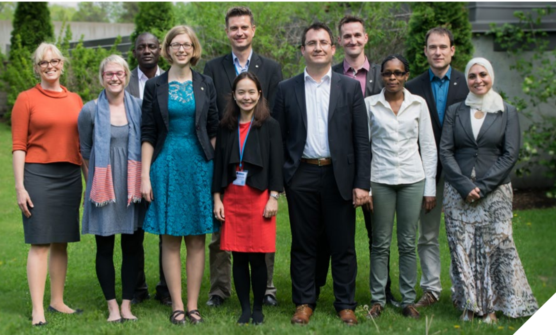
The newly elected Executive Committee gathers in the garden of Le Château Montebello.