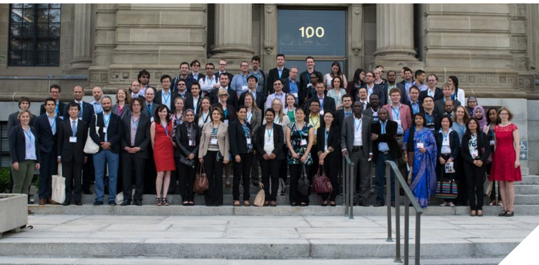
Participants of the 5th International Conference for Young Scientists in front of the NRC building in Ottawa, Canada.

In the past decades, tackling the issue of sustainable globalization has become a real challenge for scientists in both low and high resource settings. The Global Young Academy (GYA) is committed to being part of the solution to this challenge. In particular, the Fifth International Conference of Young Scientists and Annual General Meeting (AGM), titled 'Innovation for Sustainable Globalization' demonstrated our enthusiasm in this area.