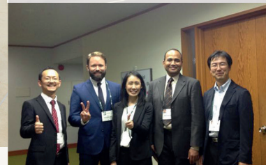
GYA members at STS Forum 2014.