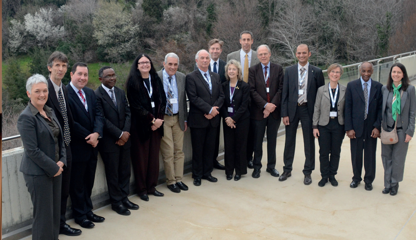
Group of officials from eight international science organizations at the TWAS headquarters, Trieste, Italy, 18 February 2014.